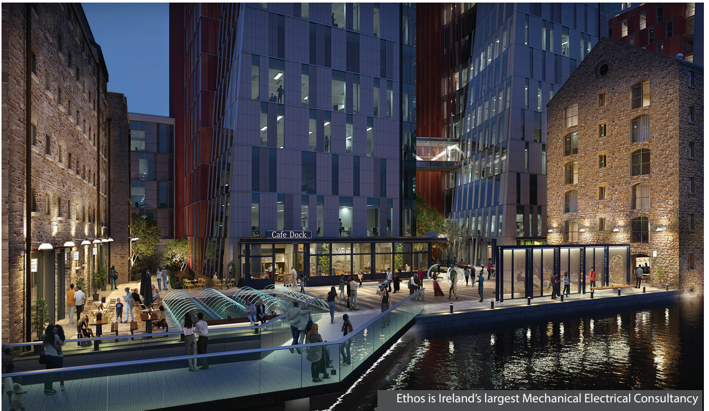
Ethos is Ireland's largest Mechanical Electrical Consultancy

He regularly holds technical internal presentations on key topics and shares his lessons learnt with the wider team to ensure issues aren't repeated in the future. The affable Dubliner has