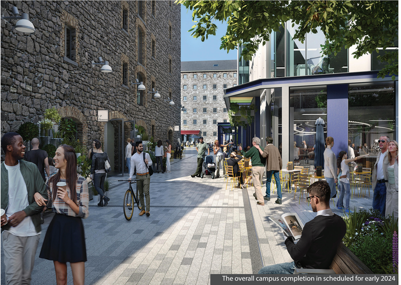
The overall campus completion is scheduled for early 2024