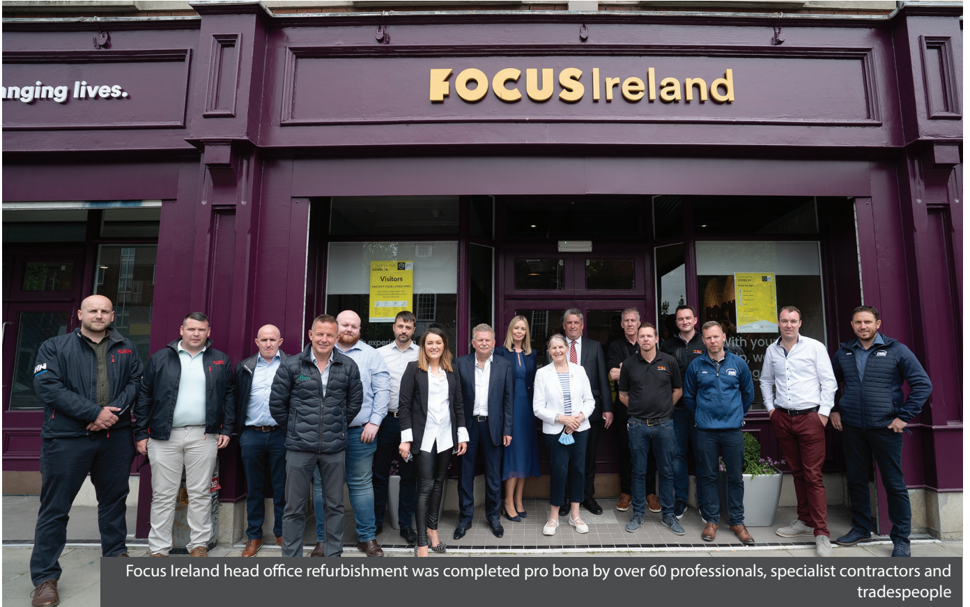
Focus Ireland head office refurbishment was completed pro bona by over 60 professionals, specialist contractors and tradespeople