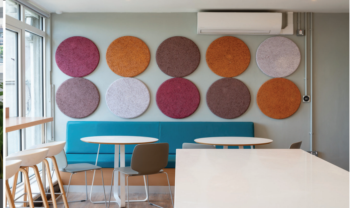
All the work at the Focus Ireland offices was done free of charge