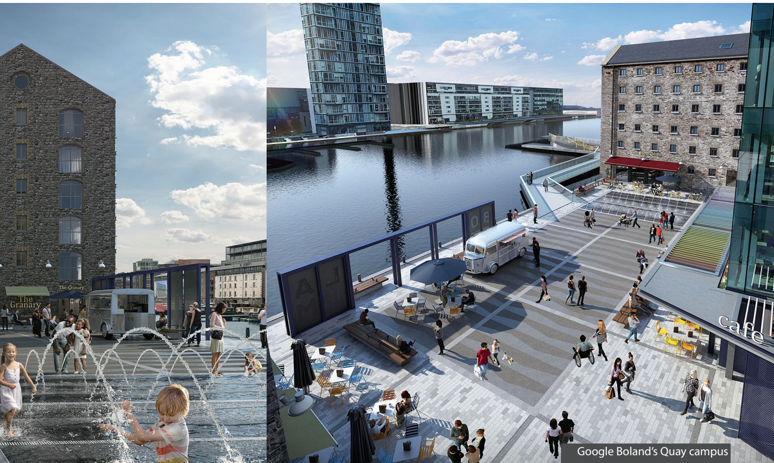
Google Boland's Quay campus

Initially, the young engineer's role focused on the technical design of building services, while working