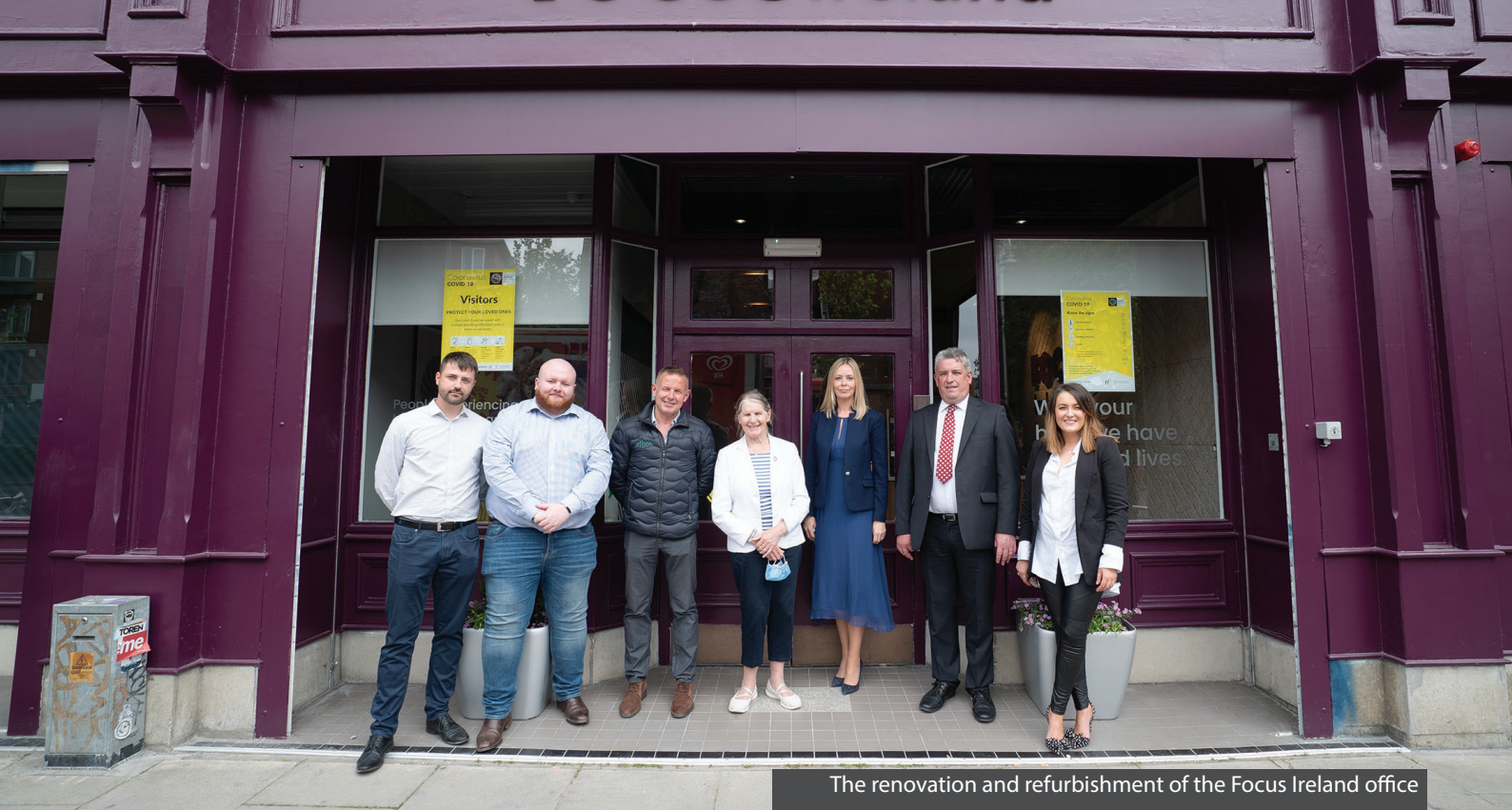
The renovation and refurbishment of the Focus Ireland office