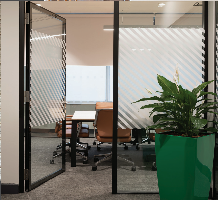
Focus Ireland's head office in Dublin was fully refurbished in July 2021